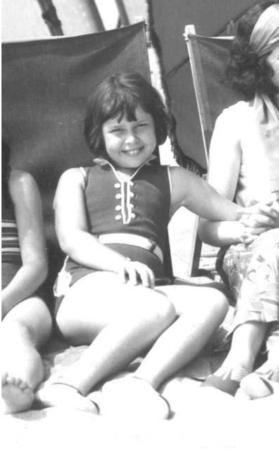
Learning how to be a lotus eater in The Marriage Playground