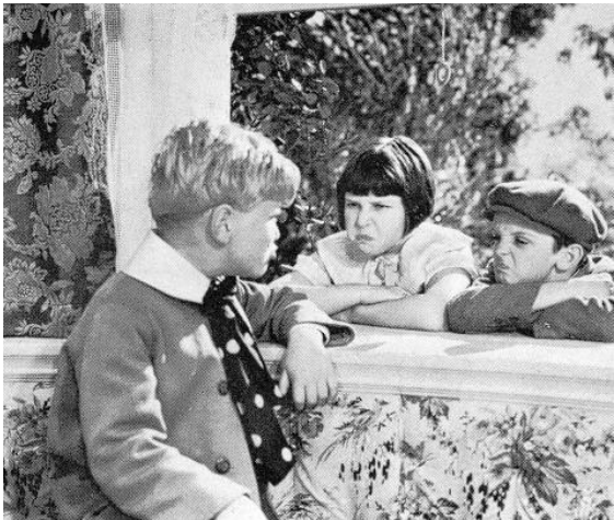
“Who cut the cheese?” sniffs Mitzi – but Jackie Cooper and Jackie Searl confess to nothing in Skippy