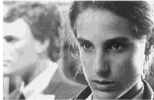
If he's thirteen I'm a Chinaman!

multi-layered, a haunting mix of vulnerability and sadistic street smart. Tightly scripted, crisply edited and exquisitely photographed. Ranks among the most powerful explorations of teen prostitution ever rendered on film. Unrated. Viewer discretion is advised. Contains graphic language, nudity and a mature sexual theme. In Danish with English subtitles. Running time: approximately 86 minutes. Item #80048 - $59.95."