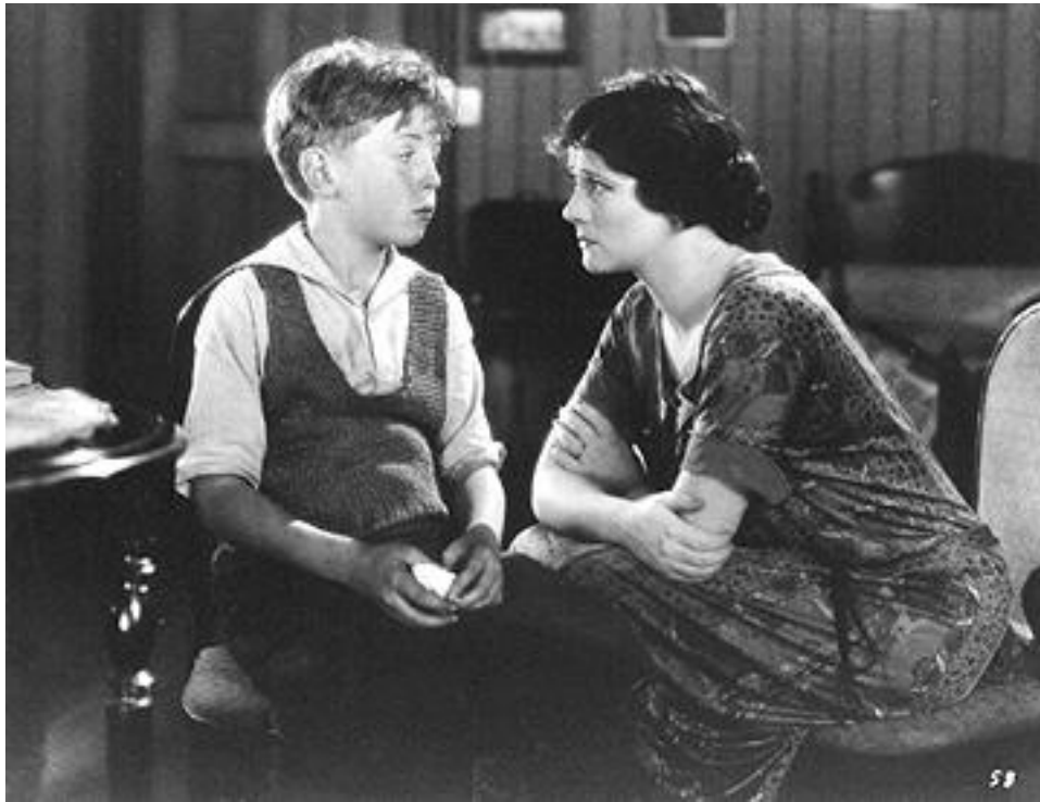
Advice from mother on how best to deal with father, in "BOY OF MINE"