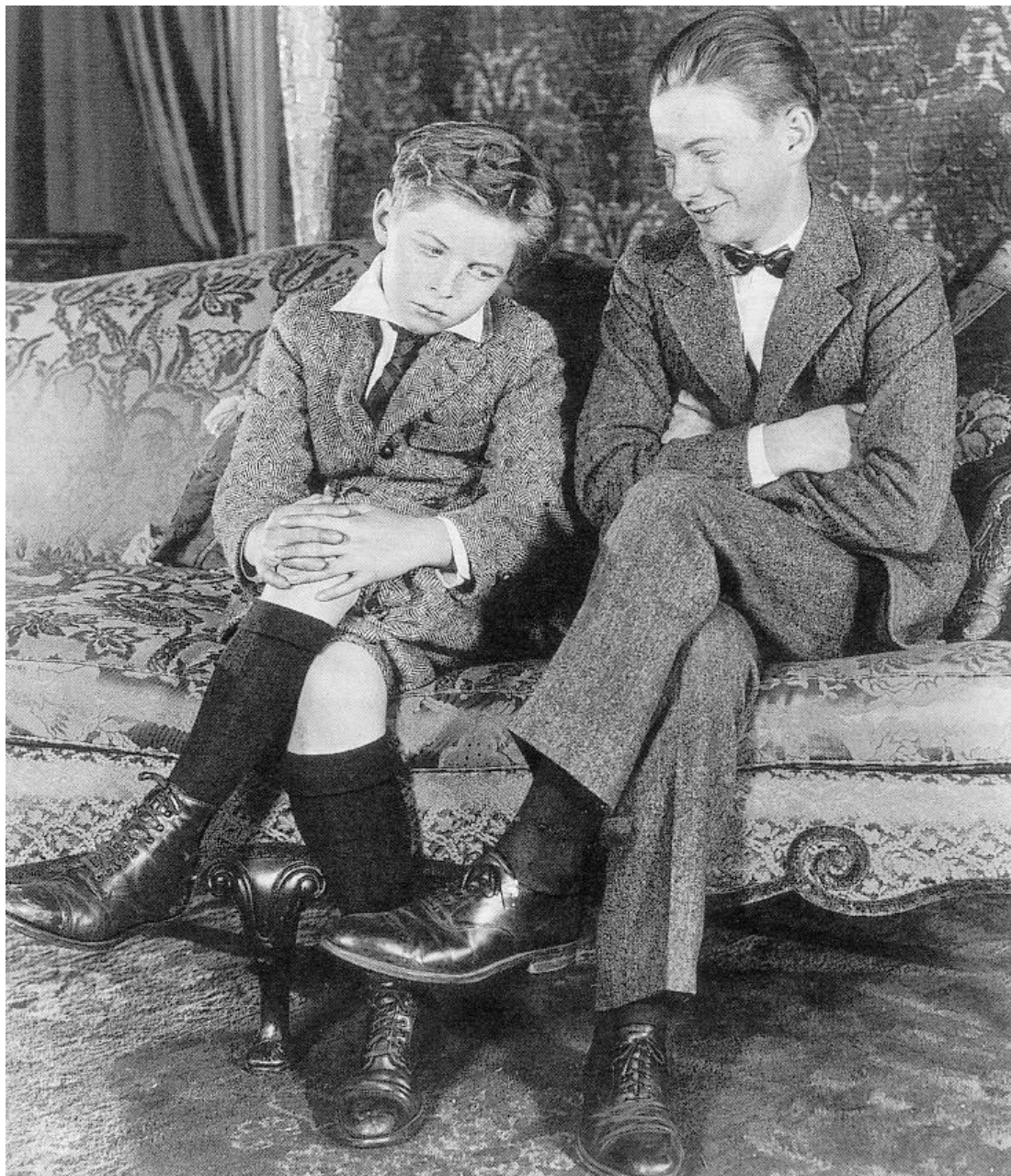
"PENROD" mk.II (Alexander) in a studio publicity shot with "PENROD" mk.I (Wesley Barry)

Born: Nicholas Benton Alexander III; Goldfield, Nevada, May 26 th 1911 Died: Hollywood; July 5 th 1969